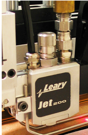
Jet200™ Micro-Adjust Valve