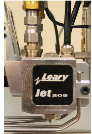
Jet205™ Fixed Stroke Valve